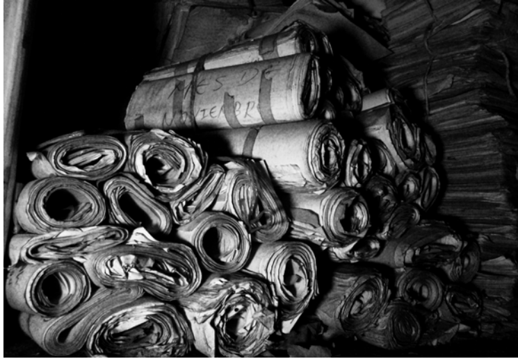
Documents in the National Police Historical Archive of Guatemala.