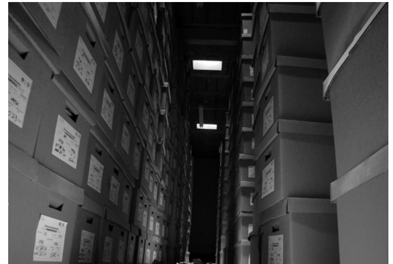
Storage boxes in the National Police Historical Archive of Guatemala.

Whichever option is selected, the authorities, responsibilities and duration of custody must be clearly and publicly stated and the records must be accessible for transitional justice and dealing with the past purposes. The issue of access to the records will be discussed in Section 9. below.